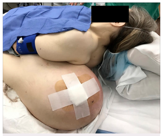
FIG. 3. Distended MM sac.

Patients living with MM over the age of 60 are rare, and the need for more research on the management and care of this patient population is warranted. We have been able to identify four reports of individuals with MM over the age of 60. Overall, these case reports depicted patients with different corresponding lesion levels